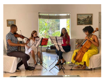
Intimate chamber music concerts