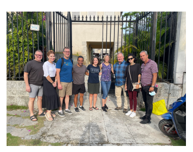
CAYO teaching artists and staff, Havana, May 2022