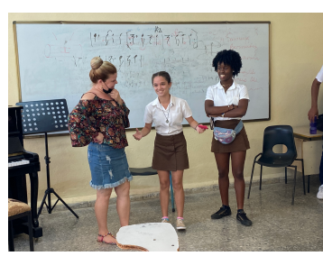
Student presentations at Escuela Nacional de Arte, Havana